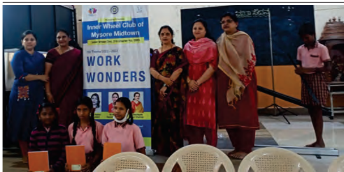
Distributed Note books worth to the students of Vanitha Sadana. It was a joint project of 8 IW clubs of Mysore.