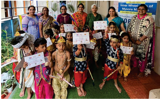
Celebrating Krishna Janmashtami with the tiny tots- cute little Krishna's and Radhas at Beginner's Bench school. Distributed certificates to all the participants of the competition.