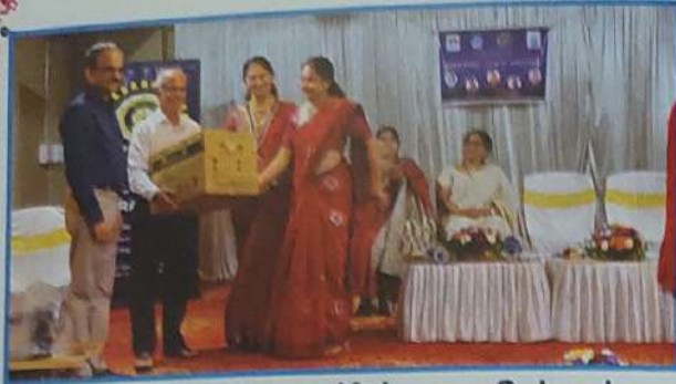
Water Purifier to Kalavaru School