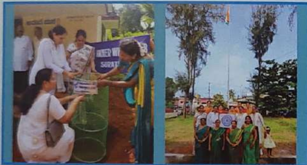
Independence day celebration at GDC & Kalavar