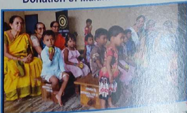
Benches to Anganwadis