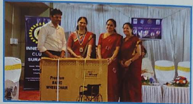
Wheel Chair to Wenlock Hospital