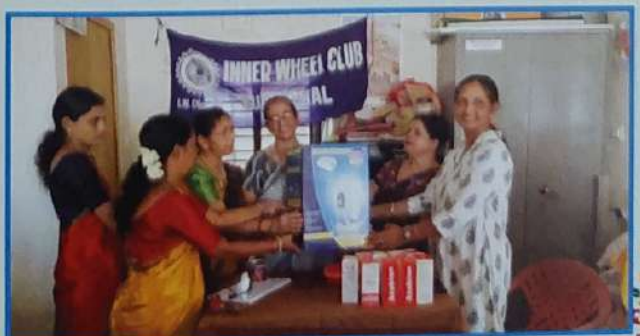
Water Purifier to Hosabettu Anganwadi