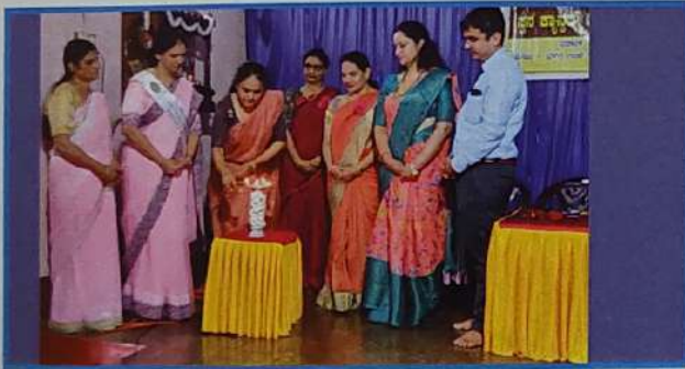
Breast Cancer Screening Camp