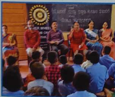
Blood Group Checkup