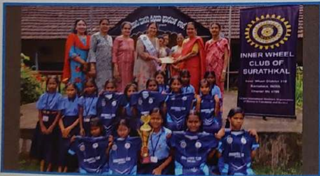
Girls Sports Support