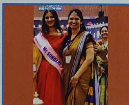
Runners up on Assembly day