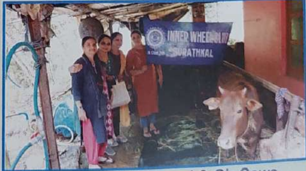
Donation of Malanad & Gir Cows