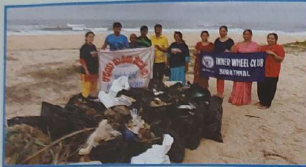
Swaccha Sagar Campaign