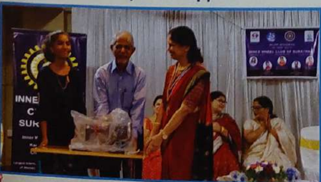
Women Empowerment Initiative