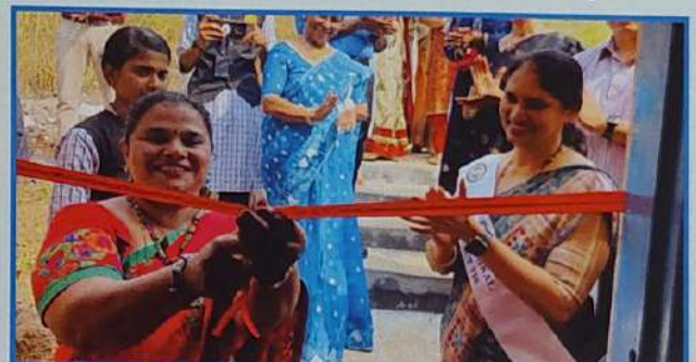
Ladies Washroom Renovation