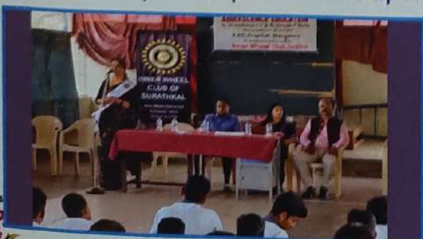
Adolescence Camp at NITK School