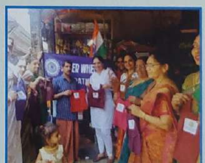
Cloth Bag Distribution