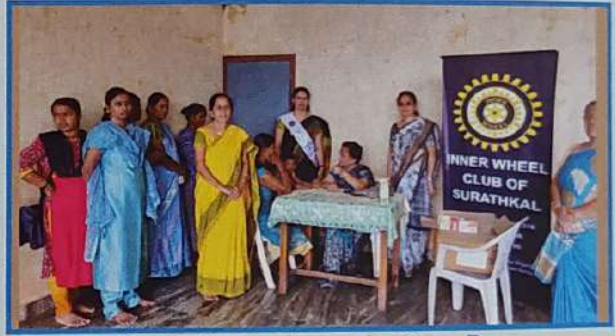
Complementary Feeding Day