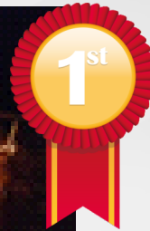
Shobha Koletthaya IWC Puttur