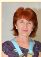
Elena Zaharieva Bulgaria