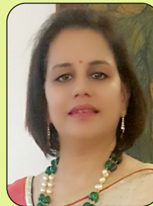
International Inner Wheel Treasurer