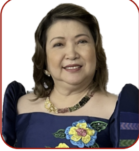
International Inner Wheel Imm. Past President